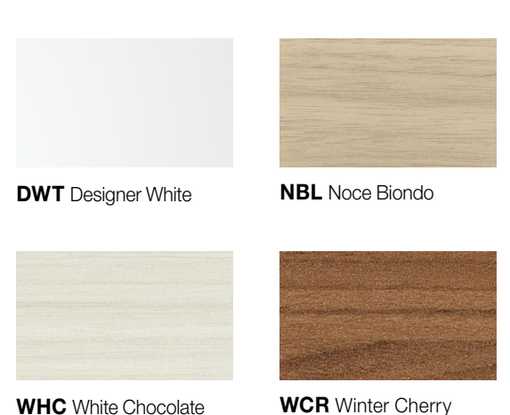
WCR Winter Cherry