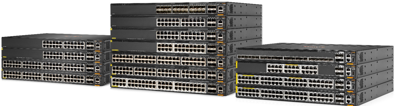
HPE Aruba Networking CX 6300 Switch Series

HPE Aruba Networking Dynamic Segmentation extends HPE Aruba Networking's foundational wireless role-based policy capability to HPE Aruba Networking wired switches. What this means is that the same security, user experience and simplified IT management can be enjoyed throughout the network. Regardless of how users and IoT devices connect, consistent policies are enforced across wired and wireless networks, keeping traffic secure and separate.