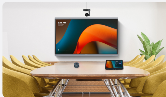
Installation Option B