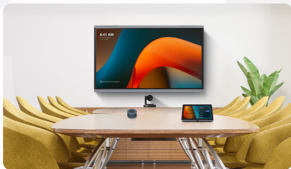
Installation Option A