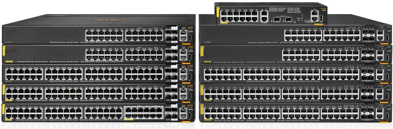
HPE Aruba Networking CX 6200 Switch Series

HPE Aruba Networking Dynamic Segmentation extends the HPE Aruba Networking's foundational wireless role-based policy capability to HPE Aruba Networking wired switches. What this means is that the same security, user experience and simplified IT management can be enjoyed throughout the network. Regardless of how users and IoT devices connect, consistent policies are enforced across wired and wireless networks, keeping traffic secure and separate.