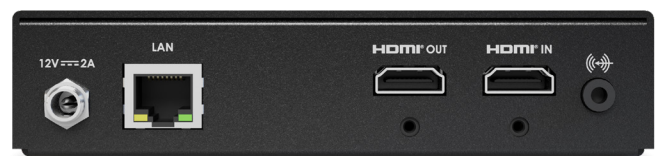
Maevox 7112A (AVC), back view

Maevox 7112H features a similar form factor to 7112A