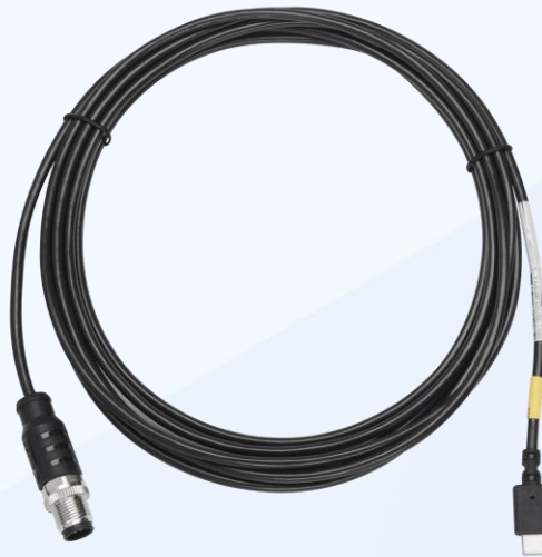
M12 to USB-C Male Client Cable, 3.5 meter