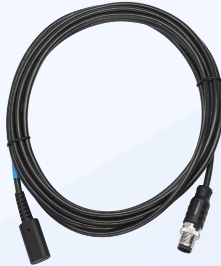
M12 to USB-C Female Receptacle Host Cable, 3.5 meter