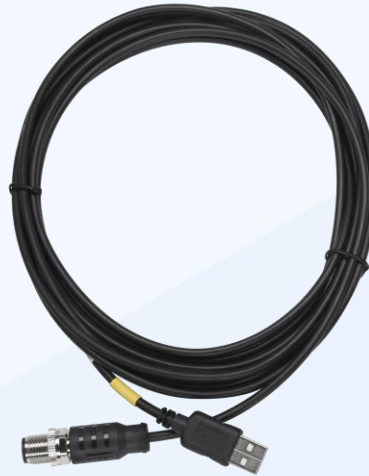
M12 to USB-A Male Client Cable, 3.5 meter