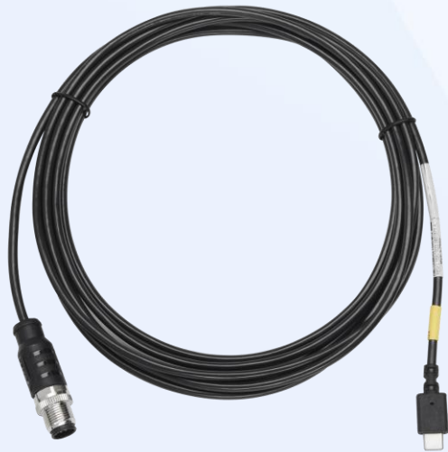
M12 to USB-C Male Client Cable, 1.5 meter