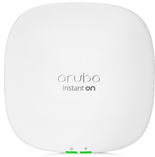
HPE Networking Instant On Access Points AP25

The HPE Networking Instant On Access Points AP25 is our top performer, with a 4x4 antenna array that supports 4 spatial streams to provide coverage and speed in device-dense networks, and is best if used in common areas where 100 or more of your customers can gather. The AP25 2.5GbE uplink port enables more network bandwidth to support the wireless maximum 5.3Gbps throughput for connected clients compared to traditional 1GbE uplink in other Wi-Fi 6 access points.