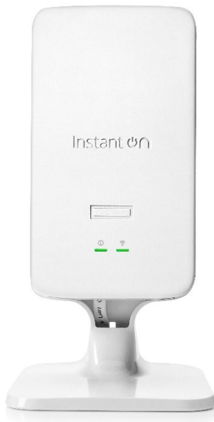
HPE Networking Instant On Access Points AP22D

The HPE Networking Instant On Access Points AP22D is the more versatile version of the AP22. It has the same antenna array and spatial streams (2x2:2) but has a 2.5GbE uplink port and four 1GbE downlink ports for hardwired devices. The AP22D can also supply Power over Ethernet (PoE) to two of the downlink ports at 15W (PoE 802.3af) when powered with Class 6 PoE 802.3bt or the optional DC power supply. When powered by Class 4 PoE 802.3af, the AP22D will supply power to one port at 15W (PoE 802.3af). This makes the AP22D great for IP phones or receipt printers in areas that need more Ethernet ports and only one in-room Ethernet port is available. Great for boutique hotel rooms, home offices, or reception areas.