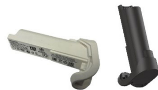
Black: SUPCAP-SCN11WC White: SUPCAP-SCN11WCHC

Battery-free super capacitor for Xenon Ultra 1962 battery-free Bluetooth scanners.