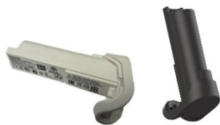
Black: BAT-SCN11WC White: BAT-SCN11WCHC

Smart battery: Lithium-ion battery for Xenon™ Ultra 1962 Bluetooth® scanners.