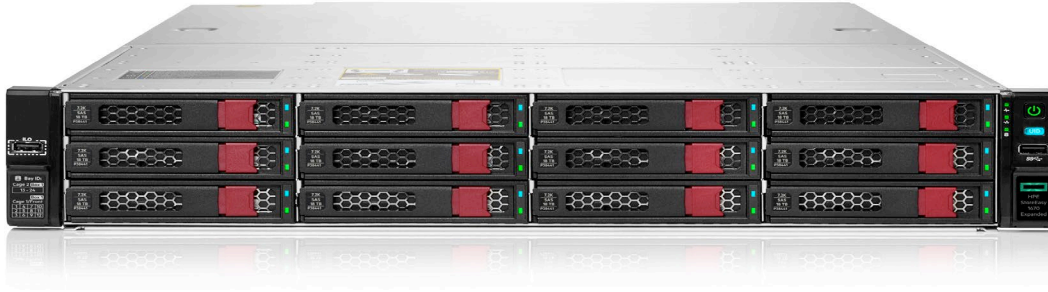
HPE StoreEasy 1670 Expanded Storage

The HPE StoreEasy 1670 Expanded Storage is a density-optimized (with 28 LFF hot-plug drive slots) 2U rack-mount form factor platform ideal for bulk file and secondary storage workloads. The StoreEasy 1670 Expanded model comes with the operating system pre-installed on mirrored NVMe boot device.