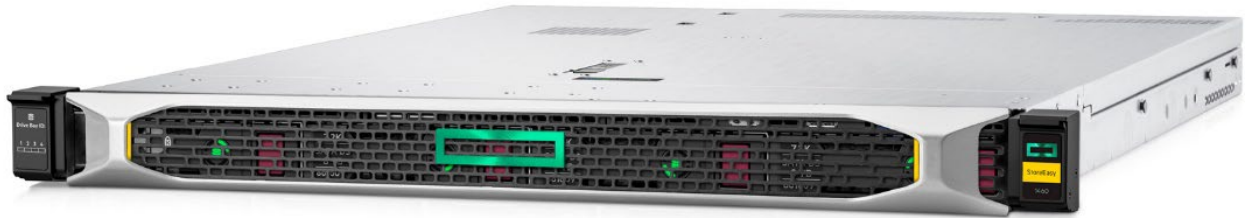
HPE StoreEasy 1460 Storage

HPE StoreEasy 1460 Storage solutions deliver multi-protocol file serving and application storage in a compact and affordable 1U rack-mount form factor that's perfect for a small workgroup, small business, or remote office. All HPE StoreEasy 1460 models come with the operating system pre-installed on the four internal LFF drives.