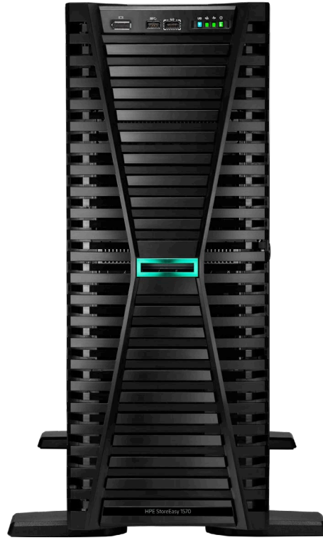
HPE StoreEasy 1570 Storage

HPE StoreEasy 1570 Storage solutions are built on a compact and affordable tower form factor package and deliver multi-protocol file serving and application storage to environments that don't have rack space, including small workgroups, small businesses, and remote offices. All HPE StoreEasy 1570 models come with the operating system pre-installed on the four internal LFF drives.