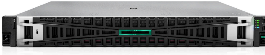
HPE StoreEasy 1670 Storage

HPE StoreEasy 1670 Storage solutions deliver high internal capacity (with up to 16 LFF hot-plug drive slots) and external expandability in a 2U rack-mount form factor for small, medium, or large IT environments. All HPE StoreEasy 1670 models come with the operating system pre-installed on mirrored NVMe boot device.