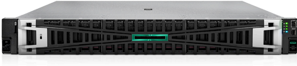
HPE StoreEasy 1870 Storage

HPE StoreEasy 1870 Storage solutions deliver enterprise-class performance (with up to 32 SFF hot-plug drive slots in a 2U rack-mount form factor) for hybrid flash configurations and latency-sensitive file share or application workloads. All HPE StoreEasy 1870 models come with the operating system pre-installed on mirrored NVMe boot device.