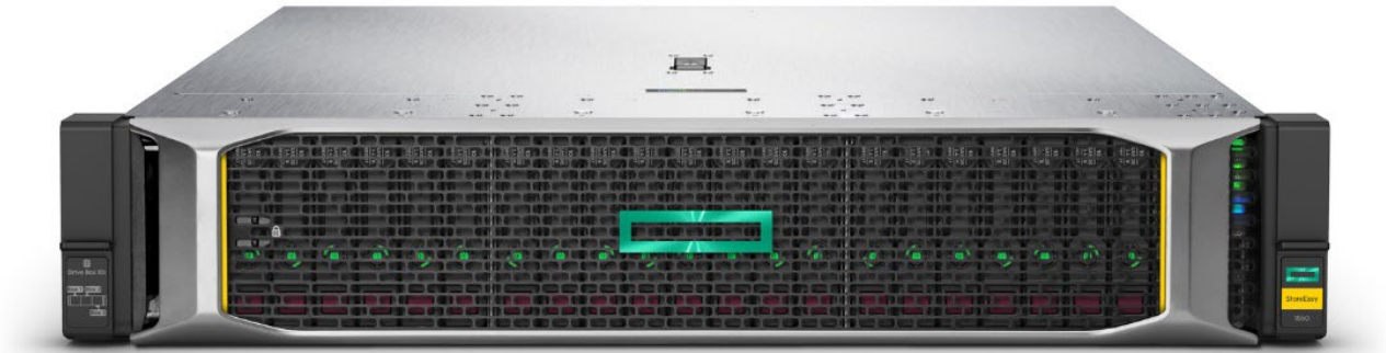
HPE StoreEasy 1860 Storage

HPE StoreEasy 1860 Storage solutions deliver enterprise-class performance (with up to 26 SFF hot-plug drive slots in a 2U rack-mount form factor) for hybrid flash configurations and latency-sensitive file share or application workloads. All HPE StoreEasy 1860 models come with the operating system pre-installed on mirrored solid state drives.