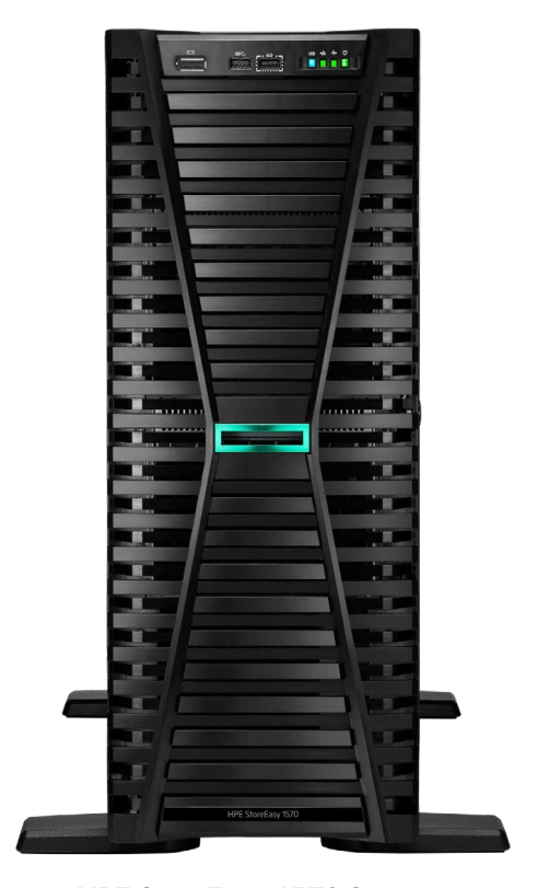
HPE StoreEasy 1570 Storage

HPE StoreEasy 1570 Storage solutions are built on a compact and affordable tower form factor package and deliver multi-protocol file serving and application storage to environments that don't have rack space, including small workgroups, small businesses, and remote offices. All HPE StoreEasy 1570 models come with the operating system pre-installed on the four internal LFF drives.