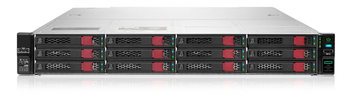
HPE StoreEasy 1670 Expanded Storage

The HPE StoreEasy 1670 Expanded Storage is a density-optimized (with 28 LFF hot-plug drive slots) 2U rack-mount form factor platform ideal for bulk file and secondary storage workloads. The StoreEasy 1670 Expanded model comes with the operating system pre-installed on mirrored NVMe boot device.