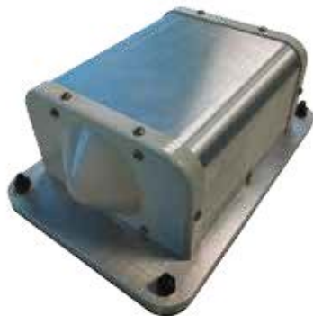
Figure 1: IW-ANT-SKD-513-Q Antenna

The antenna is designed to survive high vibration rail installations, including roof mounting on locomotive and passenger cars.