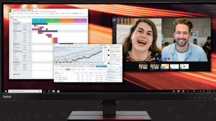
An eye – and ear – for detail

The P34w-20 kicks your work up a notch with outstanding visuals to show accurate colors from any angle. With WQHD 3440 x 1440 resolution, the monitor helps you capture even the smallest details while seeing true-to-life color with a 99% sRGB color calibration Delta E<2. Designed to impress, the 2 x 3W built-in speakers offer immersive audio that is true to your ears. The P34w-20 is also created with your health and comfort in mind, with eye-care and Natural Low Blue Light technology to reduce harmful high energy blue light emissions. Adjust the monitor height up to 150 mm to suit your ideal working style or position. Meanwhile, Lenovo ThinkColour 2 software allows you to easily and quickly adjust your screen settings with a simple click to enhance your work efficiency and optimize your monitor's extensive capabilities. Lenovo patented features, such as LAN on ThinkColour, show the network status from the screen to facilitate a more seamless workflow.