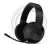
Legion H600 Wireless Headset