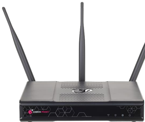
1535 and 1555 Pro Wi-Fi