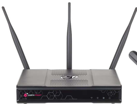
1535 and 1555 Pro Wi-Fi 6