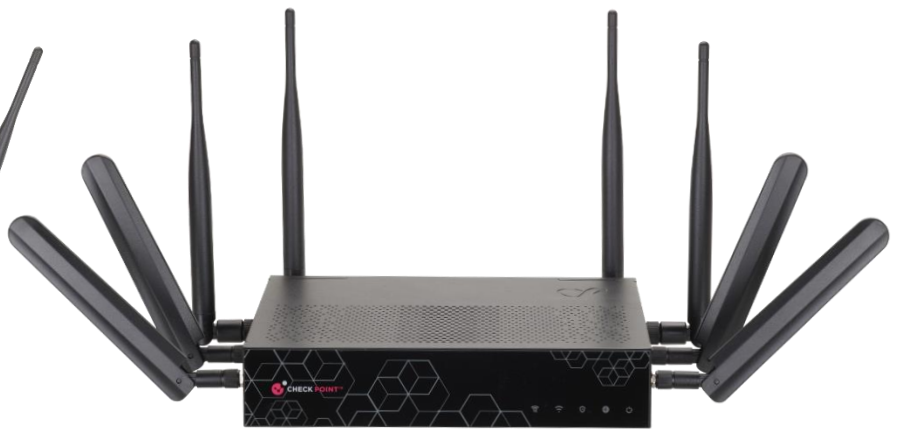
1595 Pro Wi-Fi 6 & 5G