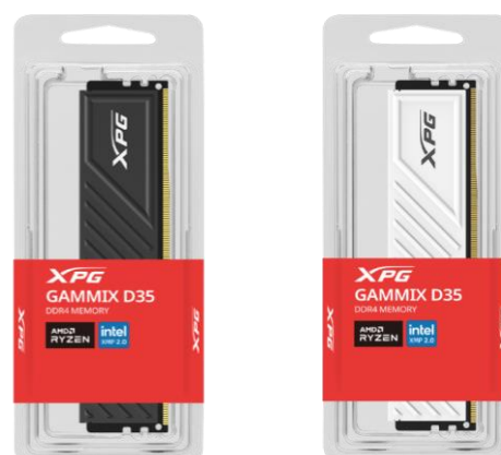
Single Tray Package