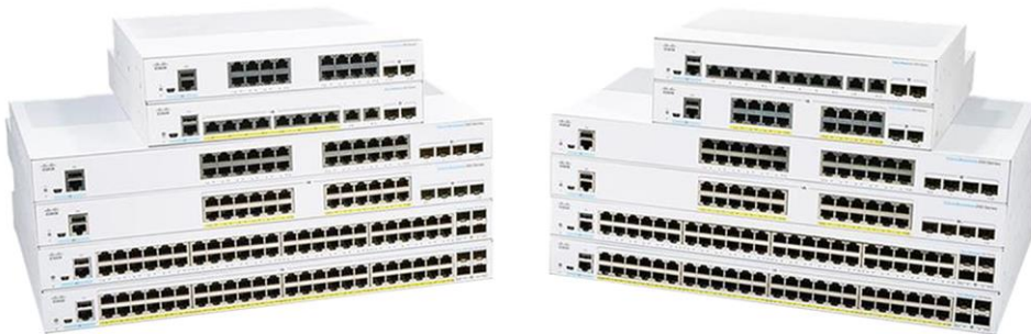
Figure 2. Cisco Business 350 series managed switches

The Cisco Business 350 Series Switches, part of the Cisco Business line of network solutions, is a portfolio of affordable managed switches that provides a critical building block for any small office network. Intuitive dashboard simplifies network setup, and advanced features accelerate digital transformation, while pervasive security protects business critical transactions. The Cisco Business 350 Series Switches provide the ideal combination of affordability and capabilities for small office and helps you create a more efficient, better-connected workforce. When your business needs advanced networking features and security for the digital transformation yet value is still a top consideration, you're ready for the Cisco Business 350 Series Switches.