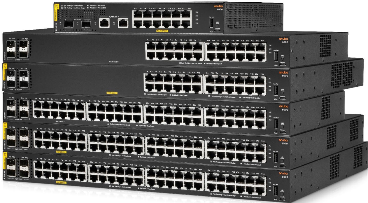
HPE Aruba Networking CX 6000 Switch Series

The HPE Aruba Networking CX 6000 Switch Series is easy to deploy and use with flexible management choices that include Web GUI, CLI, cloud based and on-premises Aruba Central management, so you can choose the best fit for your business and network environment. Delivering Layer 2 capabilities with enhanced access security, traffic prioritization, and Ipv6 support, the CX 6000 also simplifies ownership and brings peace of mind with switch software embedded with no subscription required to enable and a Limited Lifetime Warranty.