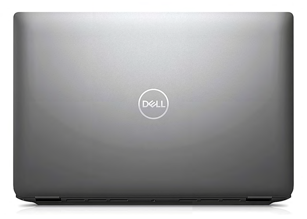
Figure 3. Color, material, and finish

This section provides the color, material, and finish (CMF) specifications of your Latitude 5440.