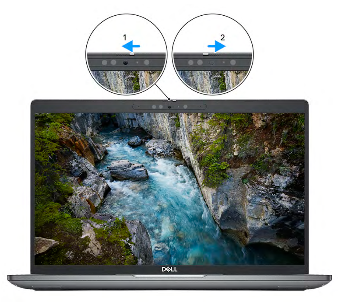
Figure 2. Camera shutter