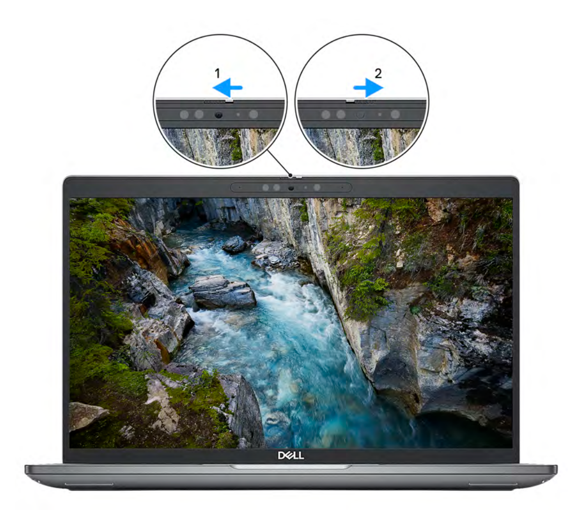
Figure 1. Camera shutter