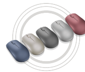
Lenovo 530 Wireless Mouse