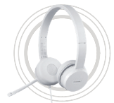
Lenovo 110 USB Stereo Headset