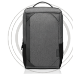
Lenovo 15.6" Laptop Urban Backpack B530