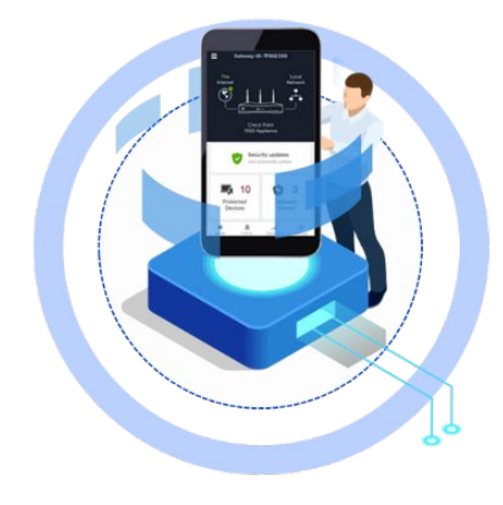
Easy to Deploy and Manage