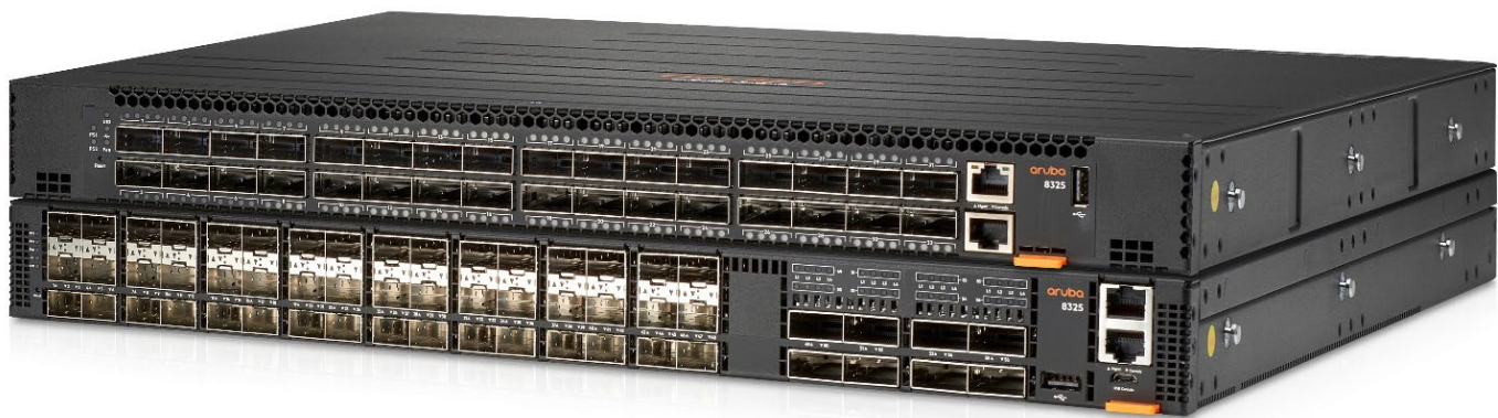
HPE Aruba Networking CX 8325 Switch Series

The CX 8325 series includes industry-leading line rate ports 1/10/25GbE (SFP/SFP+/SFP28) and 40/100GbE (QSFP+/QSFP28) with connectivity in a compact 1U form factor. These switches offer a fantastic investment for customers wanting to migrate from older 1GbE/10GbE to faster 25GbE, or 10GbE/40GbE to 100GbE ports.