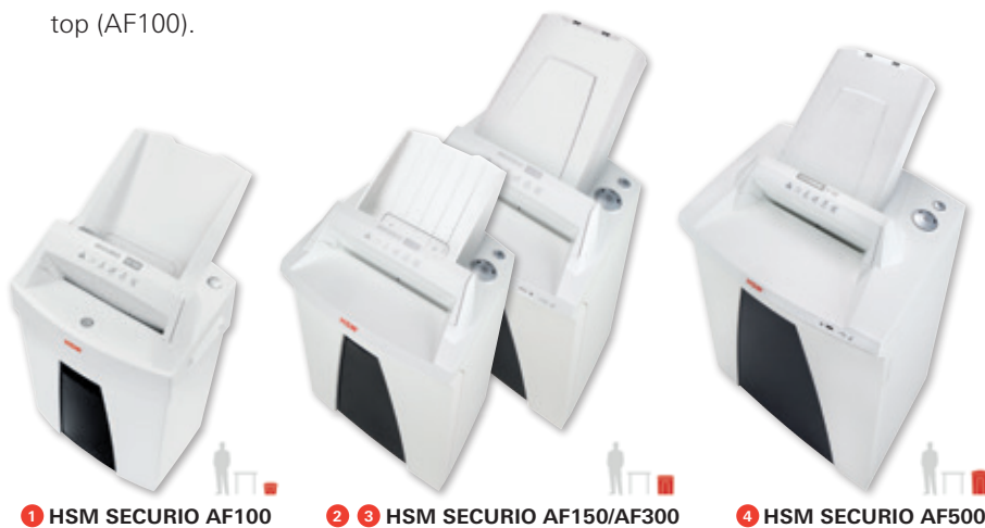
1 HSM SECURIO AF100