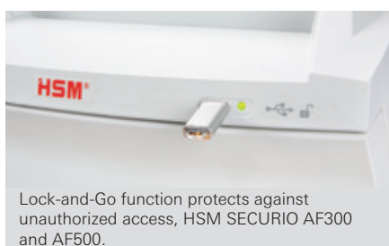
Lock-and-Go function protects against unauthorized access, HSM SECURIO AF300 and AF500.