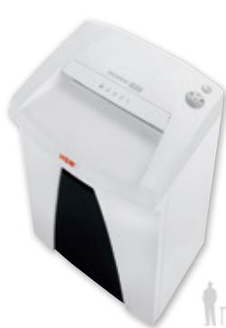
8 9 HSM SECURIO B22 / B24