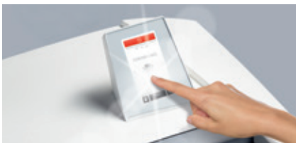
Intuitive operation and multi-language menu selection via the 4.3" touch display.