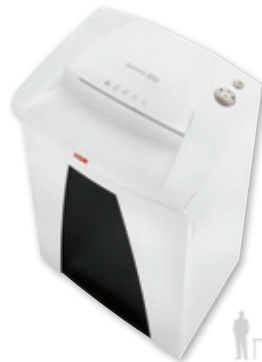
10 11 HSM SECURIO B26 / B32