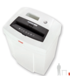
5 HSM SECURIO C14