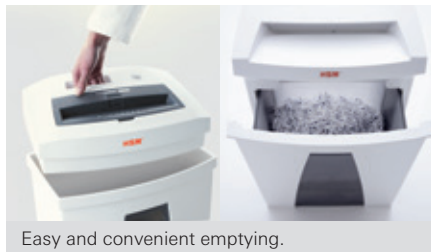
Easy and convenient emptying.