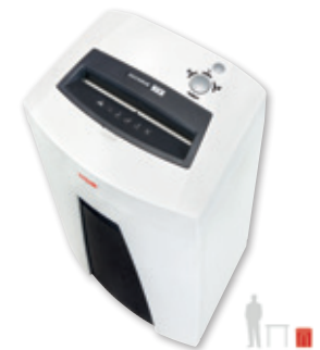
7 HSM SECURIO C18