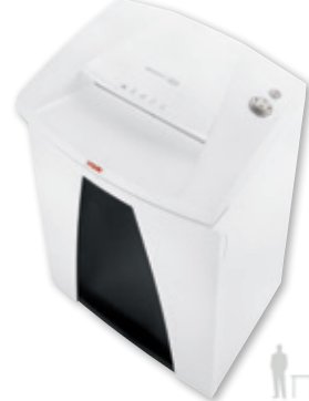
12 HSM SECURIO B34