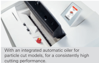
With an integrated automatic oiler for particle cut models, for a consistently high cutting performance.