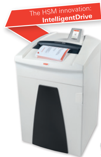
14 15 16 HSM SECURIO P36i / P40i / P44i