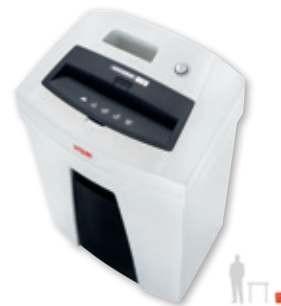
6 HSM SECURIO C16