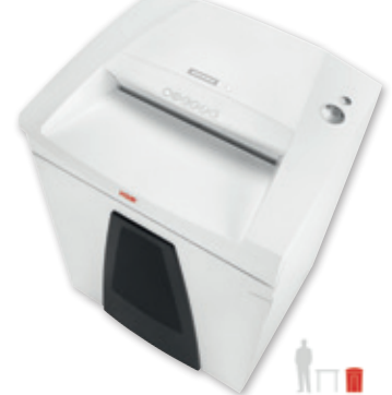
13 HSM SECURIO B35