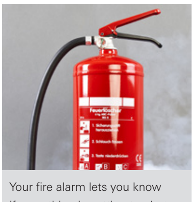
if something is getting too hot.