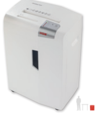
HSM shredstar X13