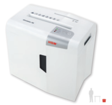
HSM shredstar X8