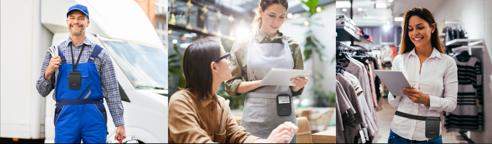
An optional carrying case further protect your printer against adverse conditions.