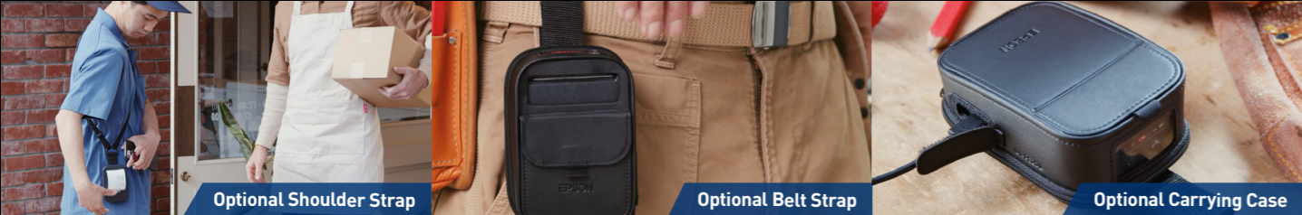
The optional shoulder and belt strap allows users to access the printer easily.