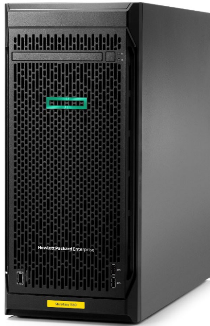
HPE StoreEasy 1560 Storage

HPE StoreEasy 1560 Storage solutions are built on a compact and affordable tower form factor package and deliver multi-protocol file serving and application storage to environments that don't have rack space, including small workgroups, small businesses, and remote offices. All HPE StoreEasy 1560 models come with the operating system pre-installed on the four internal LFF drives.