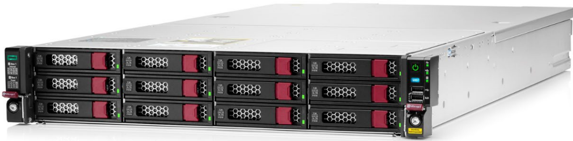
HPE StoreEasy 1660 Expanded Storage

The HPE StoreEasy 1660 Expanded Storage is a density-optimized (with 28 LFF hot-plug drive slots) 2U rack-mount form factor platform ideal for bulk file and secondary storage workloads. All StoreEasy 1660 Expanded models come with the operating system pre-installed on mirrored solid state drives.