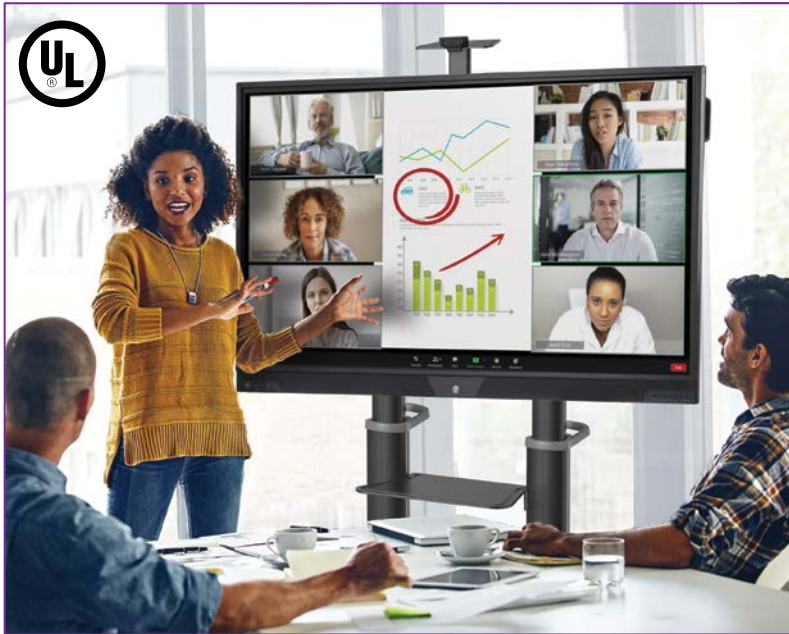
UL certified, antimicrobial carts help move even the largest displays easily.