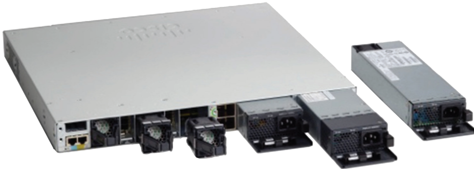
Figure 4. Cisco Catalyst 9300 Series dual redundant power supplies

Table 4 lists the different power supplies available in these switches and available PoE power.