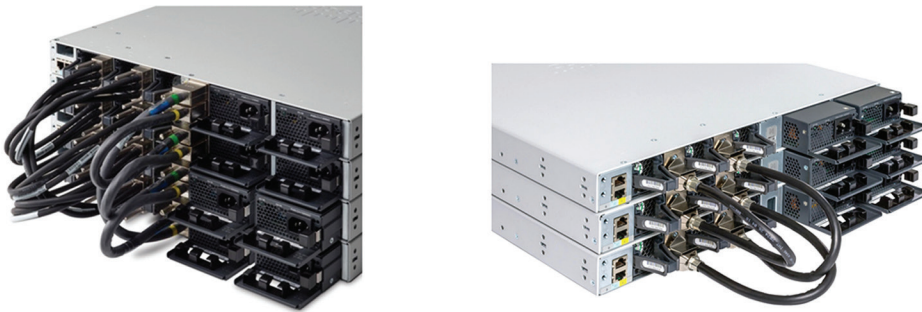
Figure 5. Cisco Catalyst 9300 Series modular uplink models stack (C9300/C9300X SKUs) and fixed uplink models stack (C9300L SKUs).

Cisco Catalyst 9300 Series Switch models are designed for stacking as a single virtual switch, enabling customers to have a single management plane and control plane for up to 448 access ports.