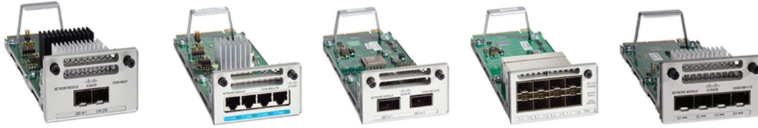
Figure 3. Cisco Catalyst 9300 Series network modules