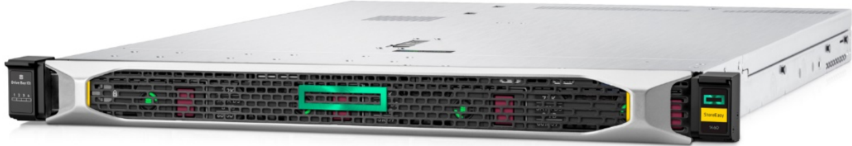
HPE StoreEasy 1460 Storage

HPE StoreEasy 1460 Storage solutions deliver multi-protocol file serving and application storage in a compact and affordable 1U rack-mount form factor that's perfect for a small workgroup, small business, or remote office. All HPE StoreEasy 1460 models come with the operating system pre-installed on the four internal LFF drives.