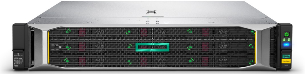
HPE StoreEasy 1660 Storage

HPE StoreEasy 1660 Storage solutions deliver high internal capacity (with up to 16 LFF hot-plug drive slots) and external expandability in a 2U rack-mount form factor for small, medium, or large IT environments. All HPE StoreEasy 1660 models come with the operating system pre-installed on mirrored solid state drives.