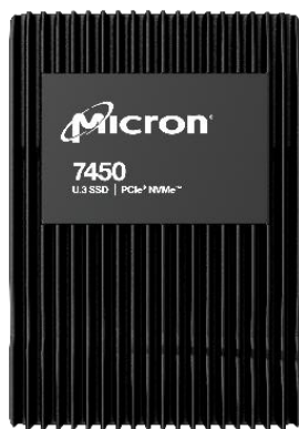
U.3: 7mm and 15mm

Designed as a mainstream solution, the 7450 SSD balances performance and density. Our offering includes a PCIe Gen4, M.2, 22 x 80mm with power-loss protection 4 and a 7.68TB E1.S that delivers industry-leading capacity. 5