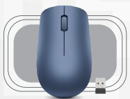
Lenovo 530 Wireless Mouse