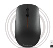
Lenovo 400 Wireless Mouse