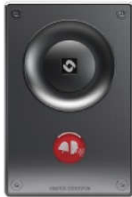
1008111020 TCIS-2 IP and SIP Intercom