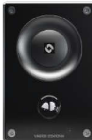
1008111030 TCIS-3 IP and SIP Intercom