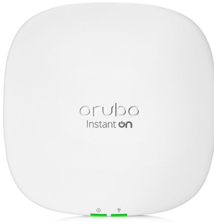
HPE Networking Instant On Access Points AP25

Features of the AP25 include orthogonal frequency-division multiple access (OFDMA), multi-user MIMO and target wake time (TWT). With up to 4 spatial streams (4SS) and 160MHz channel bandwidth (HE160), the AP25 provides groundbreaking wireless capabilities for businesses looking to boost performance and future-proof their networks.