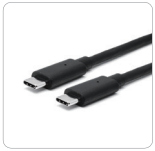
USB-C to USB-C Cable