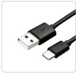
USB-C to USB Type-A Cable