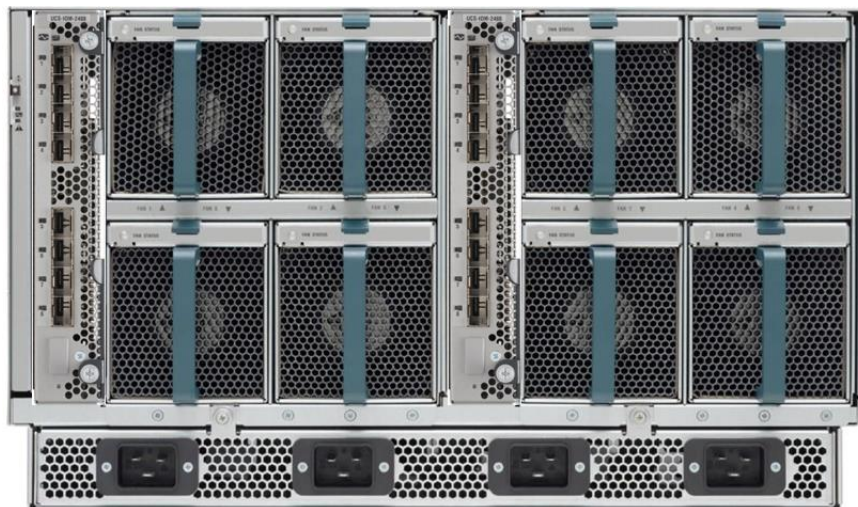
Figure 2. Rear of Cisco UCS 5108 Blade Server Chassis with two Cisco UCS 2408 Fabric Extenders

The Cisco UCS 2408 Fabric Extender has eight 25-Gigabit Ethernet, FCoE-capable, Small Form-Factor Pluggable (SFP28) ports that connect the blade chassis to the fabric interconnect. Each Cisco UCS 2408 provide 10-Gigabit Ethernet ports connected through the midplane to each half-width slot in the chassis, giving it a total 32 10G interfaces to UCS blades. Typically configured in pairs for redundancy, two fabric extenders provide up to 400 Gbps of I/O from FI 6400 series to 5108 chassis.