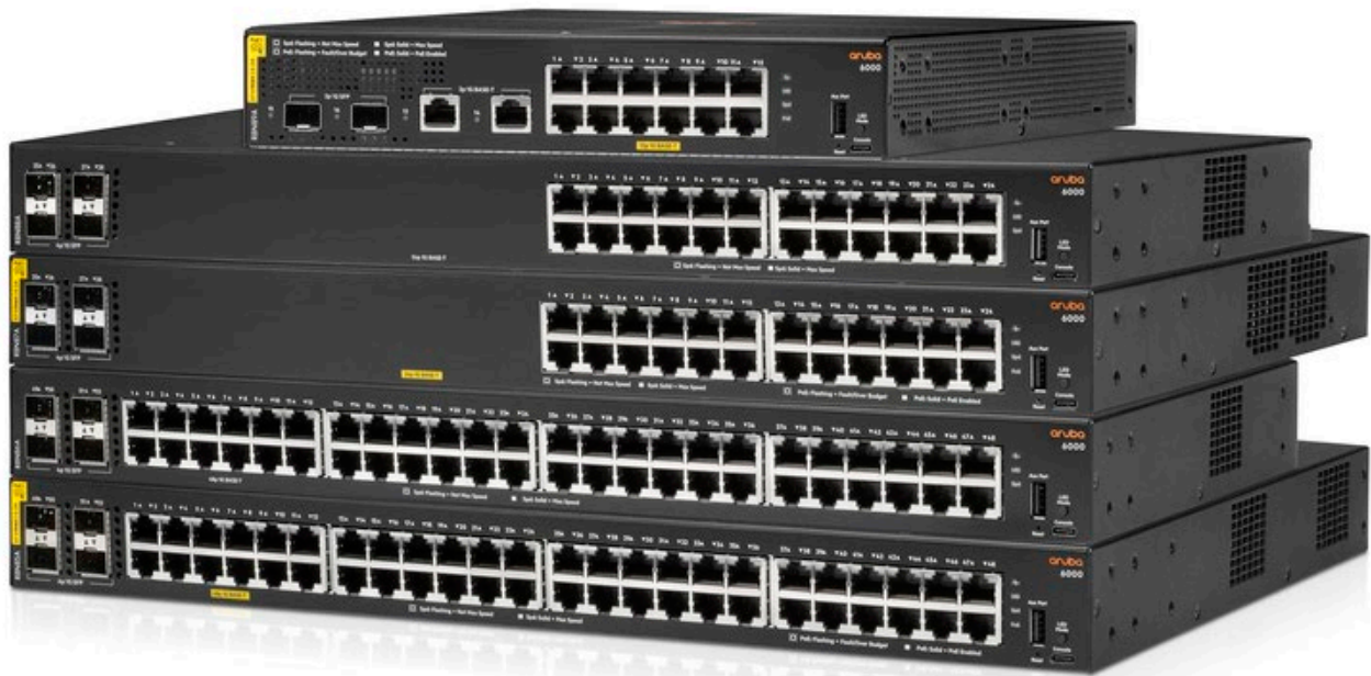
Aruba CX 6000 Switch Series

The CX 6000 series is easy to deploy and use with flexible management choices that include Web GUI, CLI, cloudbased and on-premise Aruba Central management, so you can choose the best fit for your business and network environment. Delivering Layer 2 capabilities with enhanced access security, traffic prioritization, and IPv6 support, the CX 6000 also simplifies ownership and brings peace of mind with no switch software licensing and a Limited Lifetime Warranty.