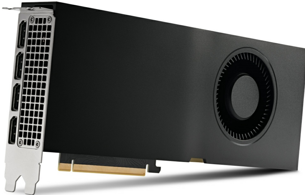
Figure 6. ThinkSystem NVIDIA RTX A4500 PCIe Active GPU