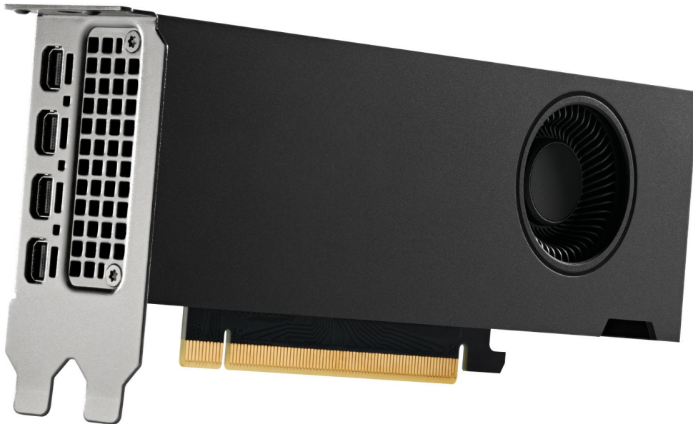
Figure 7. ThinkSystem NVIDIA RTX A2000 12GB PCIe Active GPU