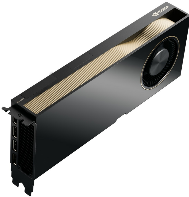
Figure 5. ThinkSystem NVIDIA Quadro RTX A6000 48GB PCIe Active GPU