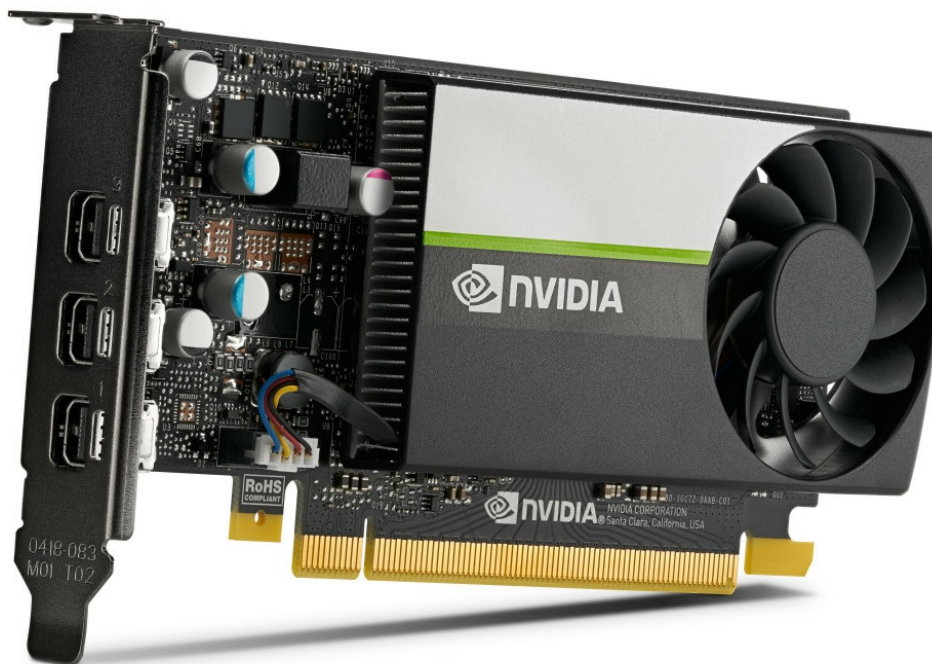
Figure 9. ThinkSystem NVIDIA Quadro RTX T400

The RTX T400 GPU features 384 CUDA cores and 2GB of GDDR6 memory, and has native support for up to three 5K displays.