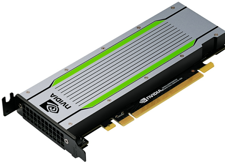
Figure 3. ThinkSystem NVIDIA T4 16GB PCIe Passive GPU

The T4 GPU provides revolutionary multi-precision performance to accelerate deep learning and machine learning training and inference, video transcoding and virtual desktops. Powering performance from FP32 to FP16 to INT8, as well as INT4 precisions, T4 delivers up to 40x higher performance than CPUs. As part of the NVIDIA AI platform, Tesla T4 supports all AI frameworks and network types, delivering dramatic performance and efficiency.