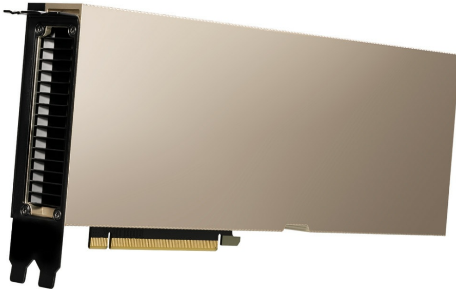
Figure 1. ThinkSystem NVIDIA A100 PCIe 4.0 Passive GPU

Lenovo ThinkSystem servers support GPU technology to accelerate different computing workloads, maximize performance for graphic design, virtualization, artificial intelligence and high performance computing applications in Lenovo servers. This document summarizes the features of the GPUs available for supported ThinkSystem servers and ThinkAgile HX, VX and MX systems.