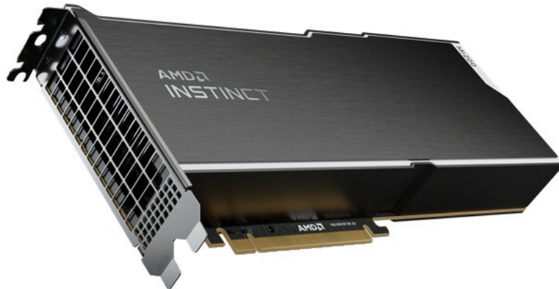
Figure 4. ThinkSystem AMD Instinct MI210 Accelerator

The ThinkSystem AMD Instinct MI210 Accelerator is a compute workhorse optimized for accelerating single precision and double-precision HPC-class system. The accelerator can also be deployed for training large scale machine intelligence workloads.