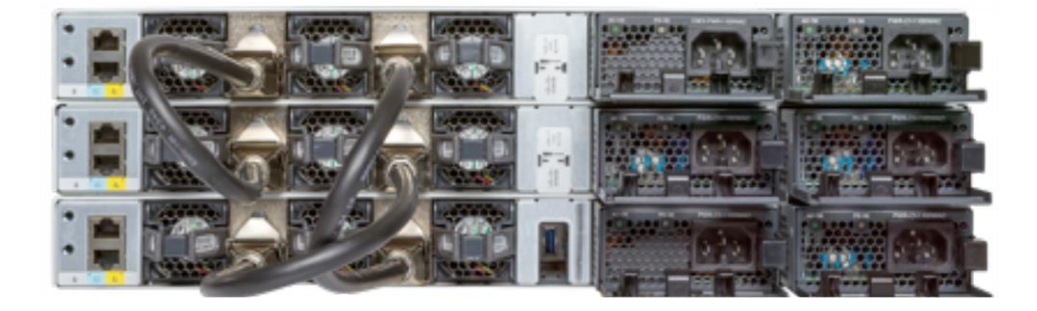
Figure 6. Cisco Catalyst 9300 Series fixed uplink models with optional stack kit