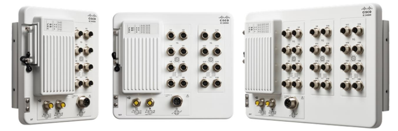
Figure 1. Front of IE-3400H-8T, IE-3400H-16T and IE-3400H-24T (from left to right)

The IE3400 Heavy Duty Series can be managed with powerful tools such as Cisco DNA Center, and can be easily set up with a completely redesigned, user-friendly, modern GUI tool called WebUI. The platform also supports Flexible NetFlow for real-time visibility into traffic patterns and threat analysis with Cisco Stealthwatch.