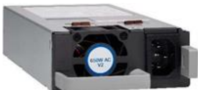
Figure 14. 650W AC power supply