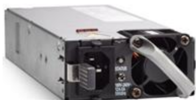
Figure 13. 950W AC power supply

Figures 13 through 15 show the power supplies available for the Cisco Catalyst 9500 Series