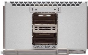
Figure 11. Cisco Catalyst 9500 Series network module 2-port 40 Gigabit Ethernet with QSFP+