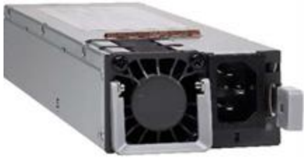
Figure 15. 1600W AC power supply

Tables 9 and 10 provides more details on the Cisco Catalyst 9500X models power supplies