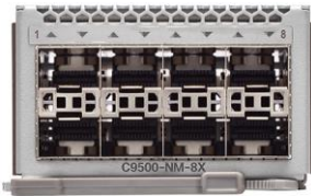
Figure 10. Cisco Catalyst 9500 Series network module 8-port 1/10 Gigabit Ethernet with SFP/SFP+

Figures 9 and 10 show the available network modules