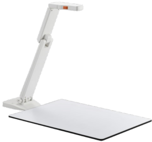
MX Writing Board (1356)