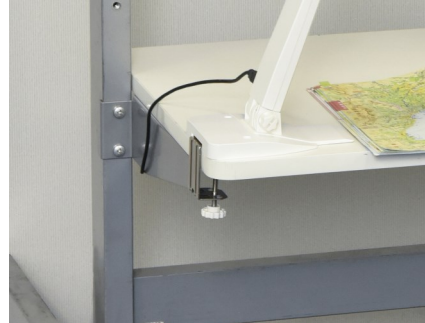
Desk Clamp (1434)