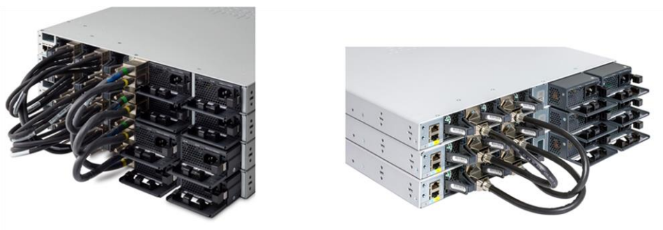
Figure 5. Cisco Catalyst 9300 Series modular uplink models stack (C9300/C9300X SKUs) and fixed uplink models stack (C9300L SKUs)

Cisco Catalyst 9300 Series switch models are designed for stacking switches as a single virtual switch, enabling customers to have a single management plane and control plane for up to 448 access ports.