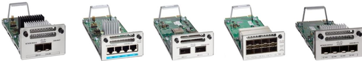
Figure 3. Cisco Catalyst 9300 Series Network Modules