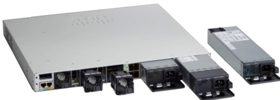
Figure 4. Cisco Catalyst 9300 Series Dual Redundant power supplies

Cisco Catalyst 9300 Series switches support dual redundant power supplies. The switches ship with one power supply by default, and the second power supply can be purchased when the switch is ordered or at a later time. If only one power supply is installed, it should always be in power supply bay #1. The switches also ship with three field-replaceable fans. Power Supplies are common across the Catalyst 9300 Series.