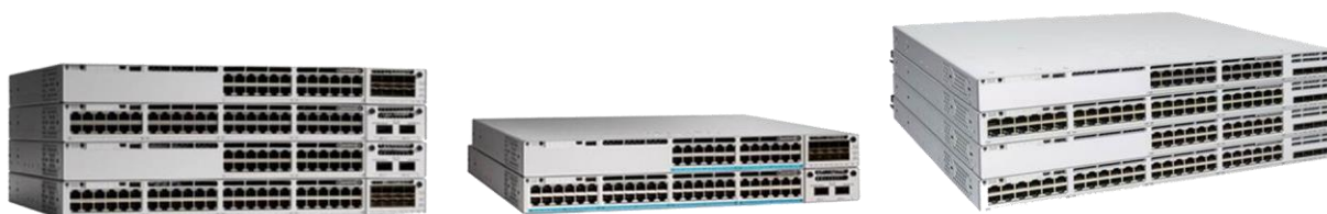
Figure 1. Cisco Catalyst 9300 Series switches

The Cisco Catalyst 9300 Series is made up of nineteen modular uplink switch models and fourteen fixed uplink switch models.