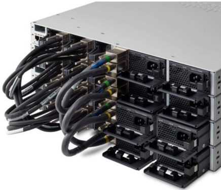
Figure 7. Cisco Catalyst 9300 Series StackPower