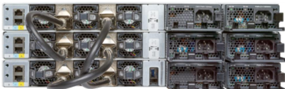
Figure 6. Cisco Catalyst 9300 Series fixed uplink models with optional stack kit