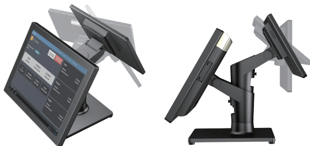
Adjustable 2nd display