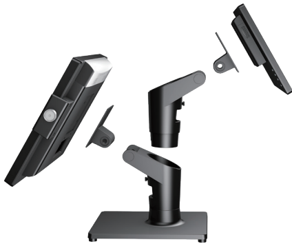
Innovative expendable design for flexible instillation