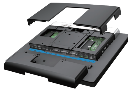
Easy replacement and maintenance design