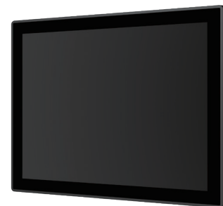
Support Wall Mount&VESA mount