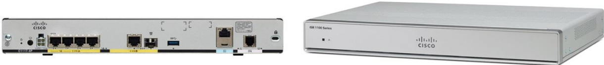
Figure 3. Cisco 1100-4P ISR with DSL, Back and Front View