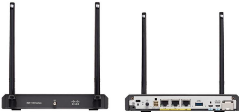
Figure 5. Cisco 1109-2PLTE with fixed CAT4 LTE (Available late October, 2018)