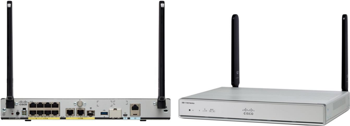
Figure 2. Cisco 1100-8P ISR with LTE Advanced, Back and Front View