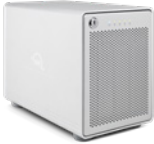
OWC Mercury Elite Pro Quad