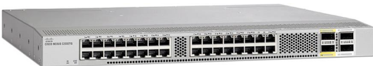
Figure 6. Cisco Nexus 2332TQ Fabric Extender (Port View)

The Cisco Nexus 2332TQ (Figure 6) is a low-port-count, low-power 10GBASE-T platform with 32 100MBASE-T and 1/10GBASE-T HIF ports as well as four 40-Gbps uplink ports to the parent switch. This platform is well suited for customers with lower power requirements and with lower port density in the rack. The 40-Gbps uplinks support BiDi optics for simple connectivity using your existing cable plan, while lowering power and solution costs. The Cisco Nexus 2332TQ supports FCoE.