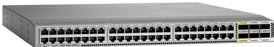
Figure 8. Cisco Nexus 2348TQ-E Fabric Extender (Port View)

The Nexus 2348TQ-E (Figure 4) is a cost optimized platform that is well suited for migration to 10GBASE-T. It supports high-density 100 Megabit Ethernet and 1 and 10 Gigabit Ethernet environments and has 48 x 100MBASE-T and 1/10GBASE-T Host Interface (HIF) ports as well up to six 40-Gbps uplink ports to the parent switch. The 40-Gbps uplinks support BiDi optics for simple connectivity using your existing cable plan, while lowering power and solution costs. The Cisco Nexus 2348TQ-E supports FCoE.