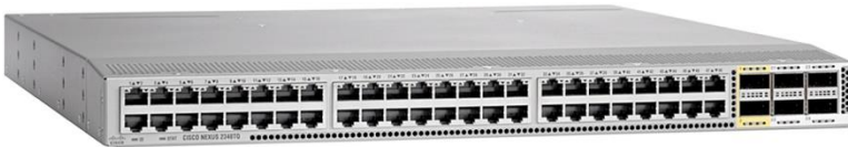
Figure 4. Cisco Nexus 2348TQ Fabric Extender (Port View)

The Nexus 2348TQ (Figure 4) is a low-power platform that is well suited for migration to 10GBASE-T. It supports high-density 100 Megabit Ethernet and 1 and 10 Gigabit Ethernet environments and has 48 x 100MBASE-T and 1/10GBASE-T host interface (HIF) ports as well up to six 40-Gbps uplink ports to the parent switch. The 40-Gbps uplinks support BiDi optics for simple connectivity using your existing cable plan, while lowering power and solution costs. The Cisco Nexus 2348TQ supports FCoE.