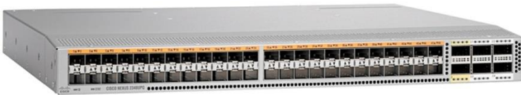
Figure 2. Cisco Nexus 2348UPQ Fabric Extender (Port View)

The Cisco Nexus 2348UPQ fabric extender (Figure 2) is a general-purpose unified port - capable (currently, Fibre Channel functions are supported only in Nexus 5600 since 7.3(0) N1 (1)) 1/10 Gigabit Ethernet fabric extender for workloads such as large-volume databases, distributed storage, and video editing. The Cisco Nexus 2348UPQ supports 48 x 1- and 10-Gbps host unified ports as well as up to six 40-Gbps uplink ports to the parent switch. The 40-Gbps uplinks support BiDi optics for simple connectivity using your existing cable plan. The unified ports provide connectivity to 2-, 4-, 8-, and 16-Gbps Fibre Channel (24 ports for 16 Gbps) as well as 1 and 10 Gigabit Ethernet and FCoE connectivity options (currently, Fibre Channel functions are supported only in hardware). The Cisco Nexus 2348UPQ has a deep 32-MB shared buffer that helps increase performance, and it supports FCoE and Data Center Bridging (DCB) network technologies, which boost the reliability, efficiency, and scalability of Ethernet networks. These features provide support for multiple traffic classes over a lossless Ethernet fabric, enabling consolidation of LAN, SAN, and cluster environments.