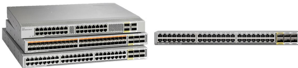
Figure 1. Cisco Nexus 2300 Platform Fabric Extenders: Cisco Nexus 2332TQ (Top Left), Cisco Nexus 2348UPQ (Middle Left), Cisco Nexus 2348TQ (Bottom Left), and Cisco Nexus 2348TQ-E (Right)

The Cisco Nexus 2300 platform has a compact 1RU design that aligns with server designs. It offers front-to-back cooling that is compatible with data center hot-aisle and cold-aisle designs. All switch ports are at the rear of the unit close to server ports, and all user-serviceable components are accessible from the front panel. The platform also offers back-to-front cooling, with switch ports in the front of the chassis aligned with the cold aisle for optimized cabling in network racks. The Cisco Nexus 2300 platform is built for nonstop operation with redundant hot-swappable power supplies and a hot-swappable fan tray with redundant fans. The 1RU form factor takes up little space, making it easy to incorporate into rack designs. The fabric extenders are available in several models with a range of speed, connectivity, and port-density options (Figure 1).