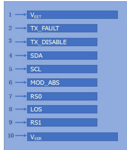
Bottom of Board