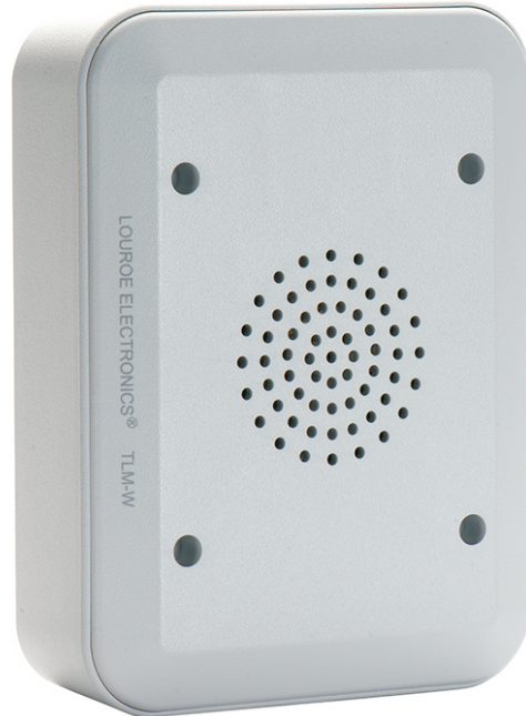
MODEL TLM-W Speaker/Microphone