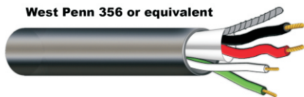
West Penn 356 or equivalent